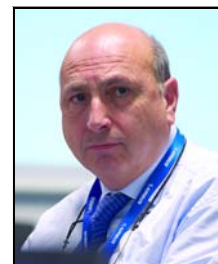
Claude Lelaie, Airbus senior vice president of safety

back. Even with the engines running, the noise level in the A380 cockpit was no more than in a regular automobile with the windows rolled up. Only Lelaie’s interactions with the ground crew and ATC from the right seat broke the silence.